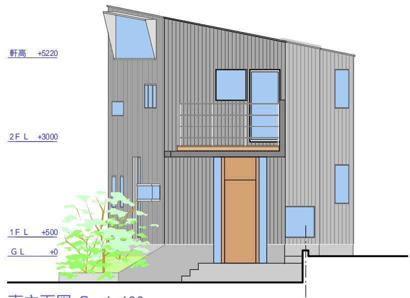
東立面図 S = 1 :100